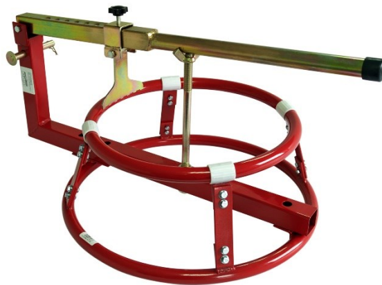
Illustration similar, may vary depending on model

Please read and follow the operating instructions and safety information prior to initial operation.