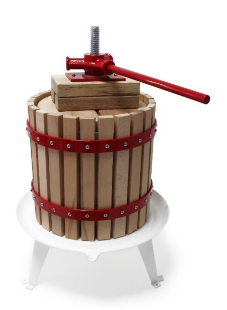
Illustration similar, may vary depending on model

Please read and follow the operating instructions and safety information prior to initial operation.