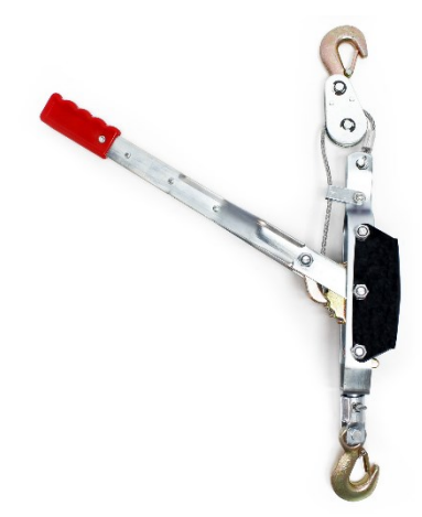
Illustration similar, may vary depending on model

Please read and follow the operating instructions and safety information prior to initial operation.