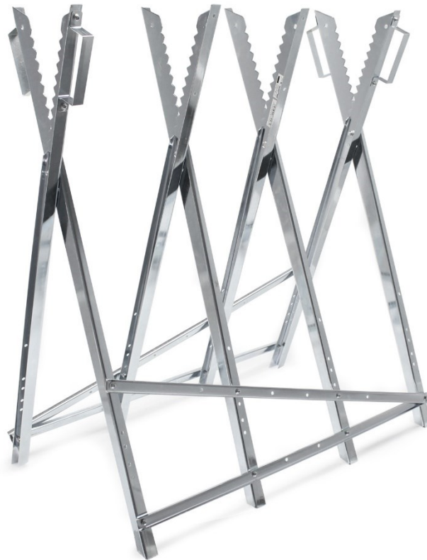
Illustration similar, may vary depending on model

Please read and follow the operating instructions and safety information prior to initial operation.