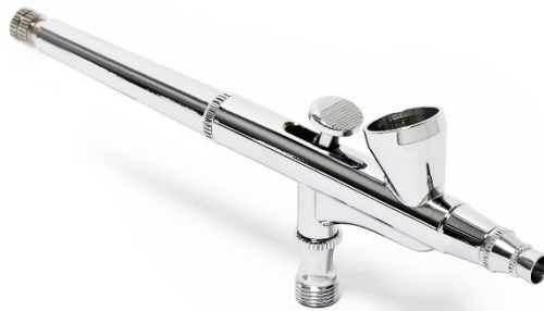
Illustration similar, may vary depending on model

Please read and follow the operating instructions and safety information prior to initial operation.