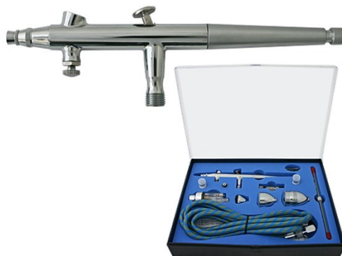
Illustration similar, may vary depending on model

Please read and follow the operating instructions and safety information prior to initial operation.