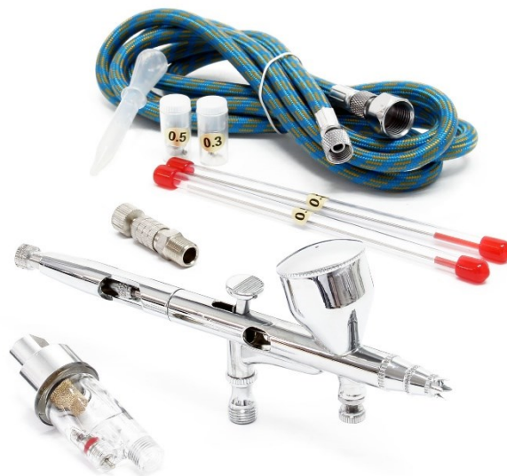
Illustration similar, may vary depending on model

Please read and follow the operating instructions and safety information prior to initial operation.