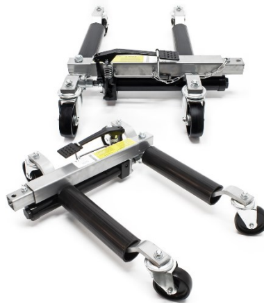
Illustration similar, may vary depending on model

Read and follow the operating instructions and safety information before using for the first time.