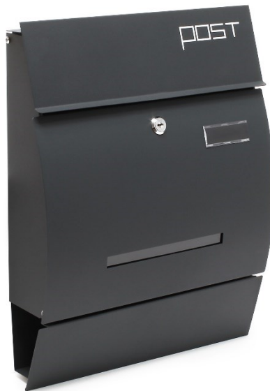
Illustration similar, may vary depending on model

Read and follow the operating instructions and safety information before using for the first time.