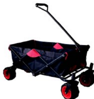
9. The fully unfolded cart should look like the one in the photo.