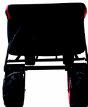
8. The wheels must then be at both ends of the axle.