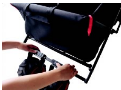
7. Loosen the two rear wheels to pull them to the right and left.