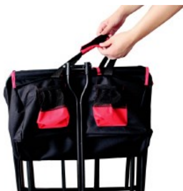
4. Pull apart the Velcro fastener on the handle of the bag.