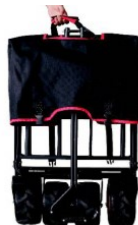
3. Remove the carrying case from the cart.