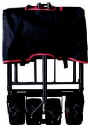
1. Unpack the folded cart and lay it flat on the floor.