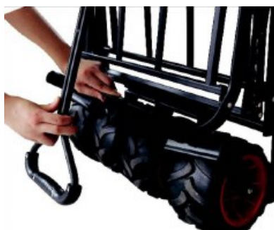
5. Remove the handle from the plastic fastener.