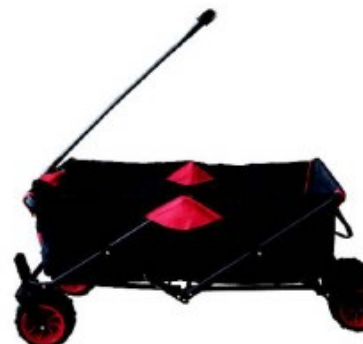
6. Unfold the cart (see photo).