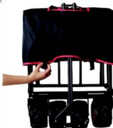
2. Press the plastic buckles on the carrying case to open it.