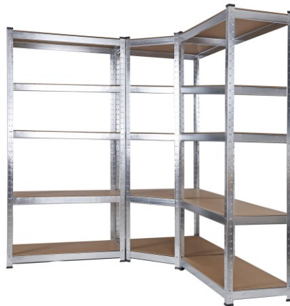
Illustration similar, may vary depending on model

Read and follow the operating instructions and safety information before using for the first time.