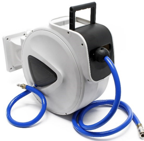
Illustration similar, may vary depending on model

Read and follow the operating instructions and safety information before using for the first time.