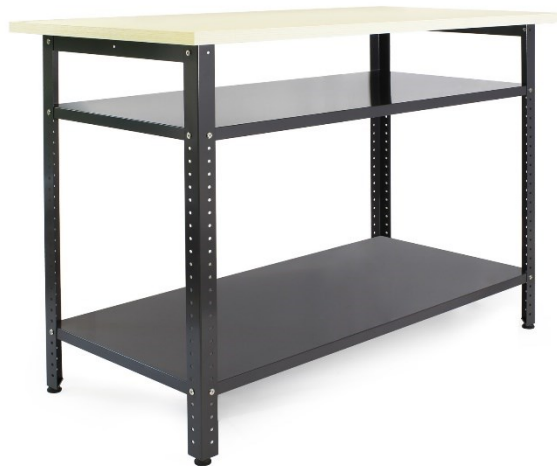
Illustration similar, may vary depending on model

Please read and follow the operating instructions and safety information prior to initial operation.