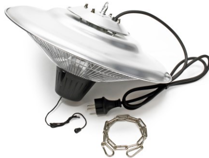
Illustration similar, may vary depending on model

Read and follow the operating instructions and safety information before using for the first time.