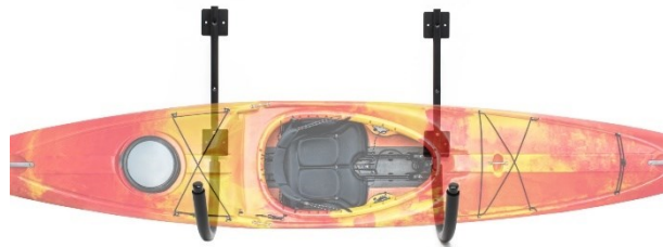
Illustration similar, may vary depending on model

Please read and follow the operating instructions and safety information prior to initial operation.