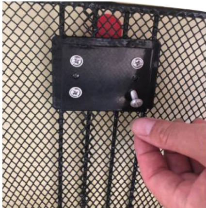
5. Utilise 4 screws in order to fix both plates in place.