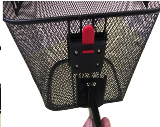
8. Press the basket against the fixture, then press the clamping lock and slide it down until it clicks into place.