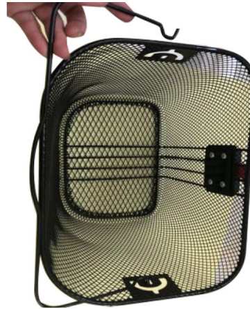
6. Attach the handle to the basket by connecting its ends to the appropriate openings.