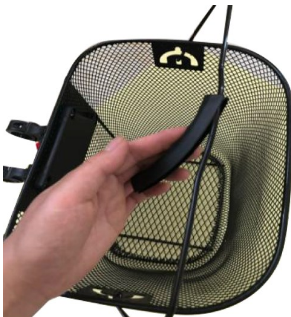
7. Connect the plastic cover to the handle.