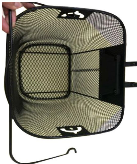
6. Attach the handle to the basket by connecting its ends to the appropriate openings.