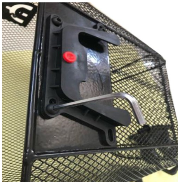
5. Attach both parts to the basket by fixing the screws.