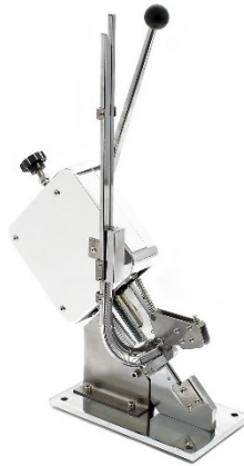
Illustration similar, may vary depending on model

Please read and follow the operating instructions and safety information prior to initial operation.