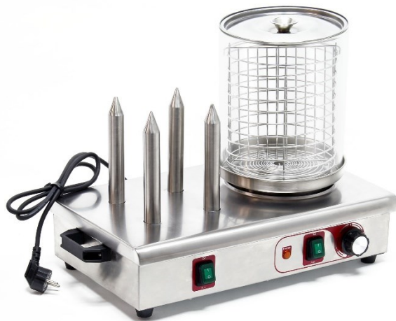
Illustration similar, may vary depending on model

Please read and follow the operating instructions and safety information prior to initial operation.