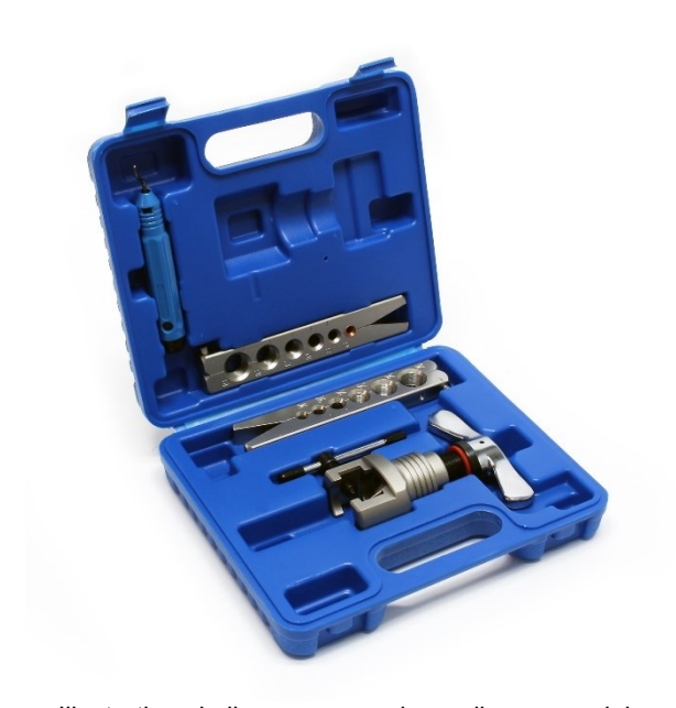
Illustration similar, may vary depending on model

Read and follow the operating instructions and safety information prior to initial operation.