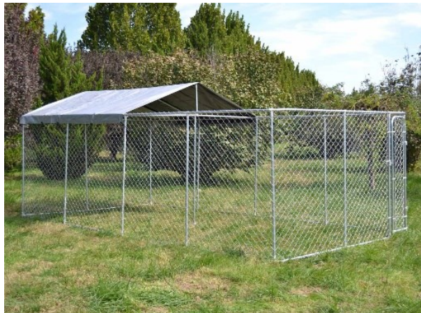
Illustration similar, may vary depending on model

Please read and follow the operating instructions and safety information prior to initial operation.