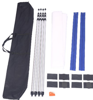
Illustration similar, may vary depending on model

Read and follow the operating instructions and safety information prior to initial operation.