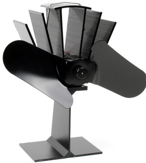
Illustration similar, may vary depending on model

Read and follow the operating instructions and safety information before using for the first time.