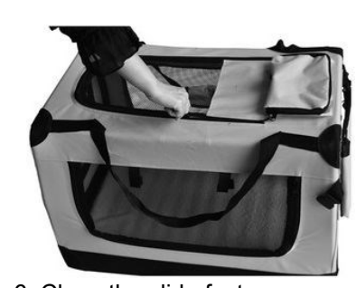
6. Close the slide fastener.

WilTec Wildanger Technik GmbH Königsbenden 12 52249 Eschweiler - Germany E-mail: service@wiltec.info