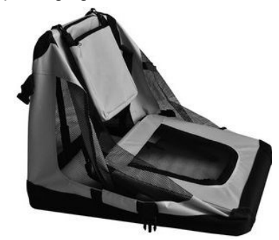
3. Open the product.